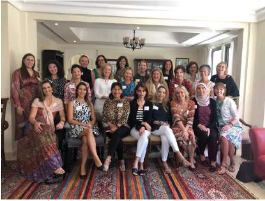
Memories from our February's Newcomers Coffee Morning

Hello to everyone and welcome to the newcomers!