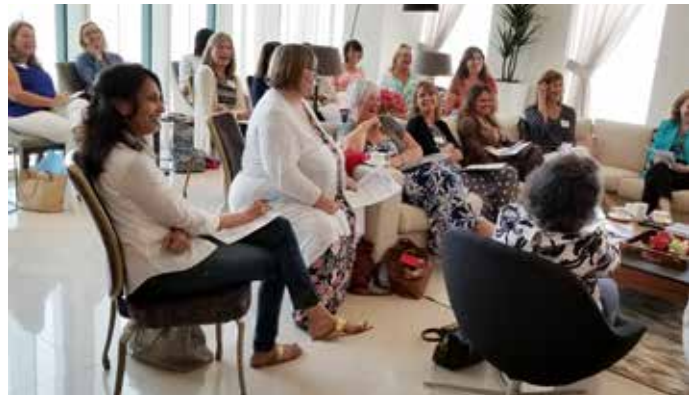
Friends of AWN Coffee