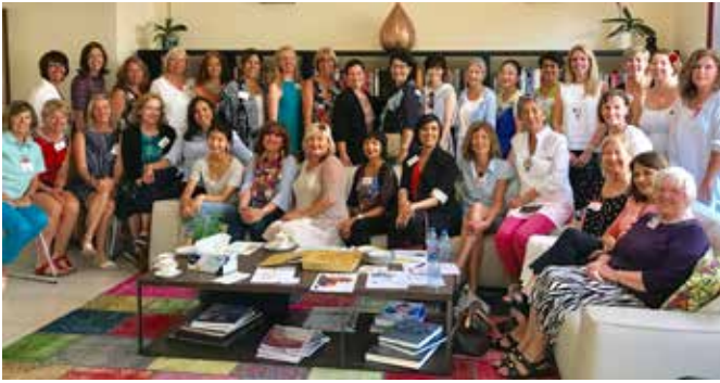
Newcomers to Abu Dhabi connect with AWN during special coffees in October.