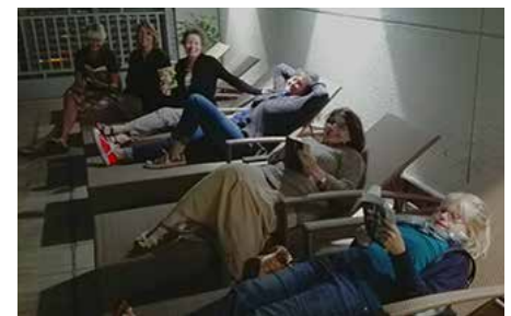
Evening Book Group

American writer Edmund Wilson once said, "No two persons ever read the same book."